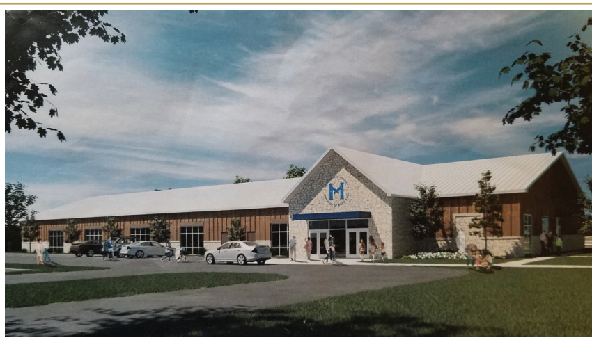
new prayer and events center