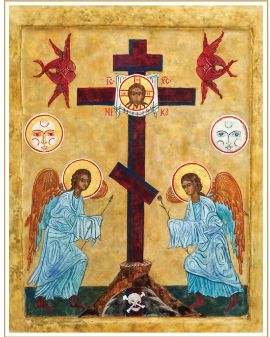
Angels with Holy Cross