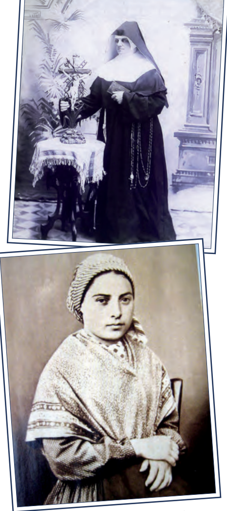
Top: Adele Brise Bottom: Bernadette Soubirous