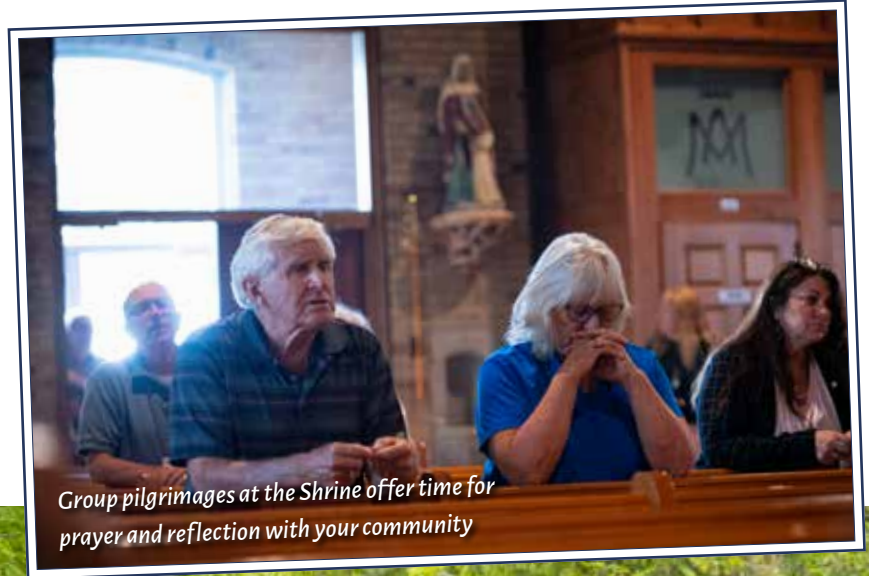
Group pilgrimages at the Shrine offer time for prayer and reflection with your community

Contact our pilgrimage office at 920-866-2571 ext 113