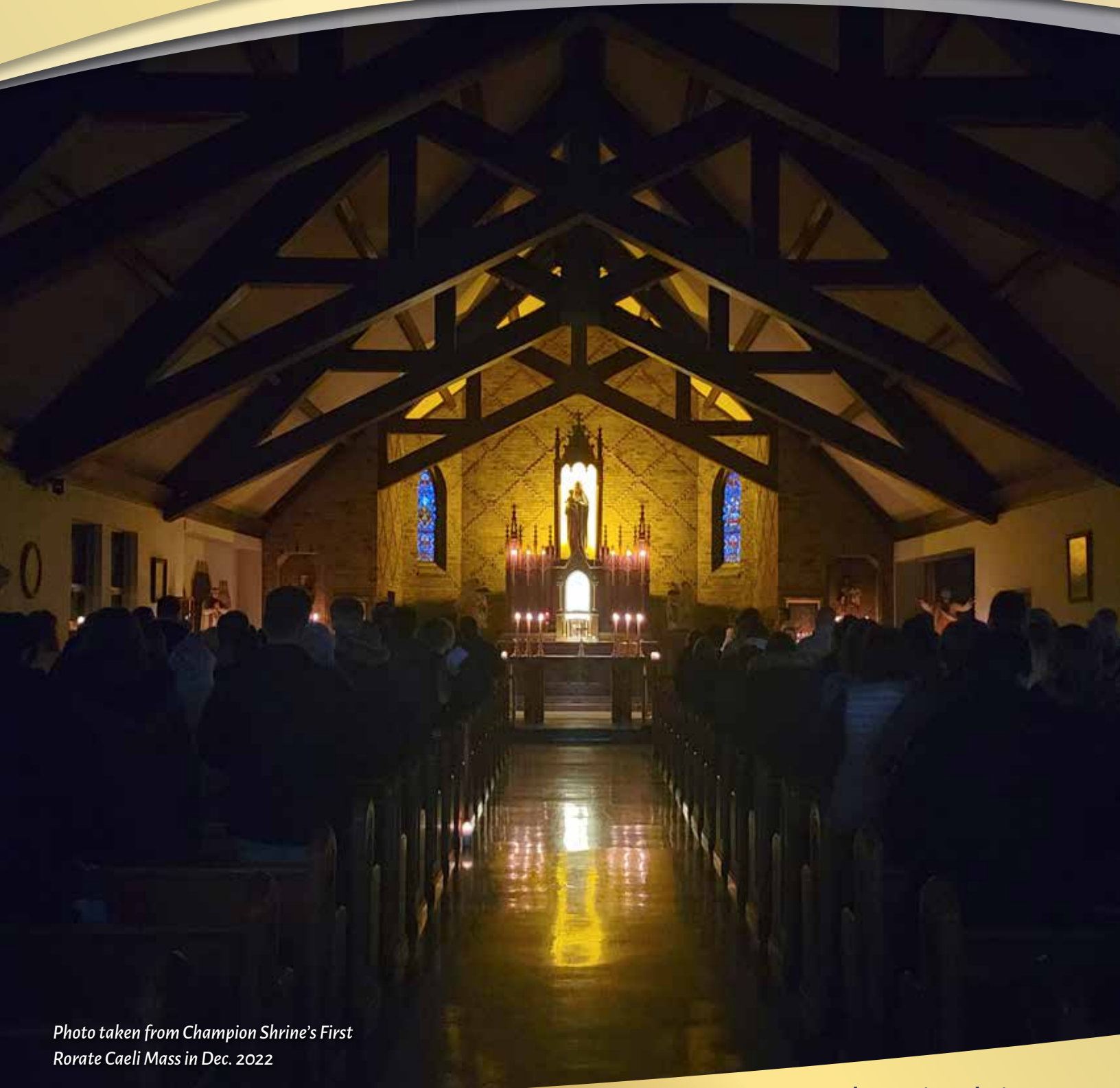
Photo taken from Champion Shrine's First Rorate Caeli Mass in Dec. 2022