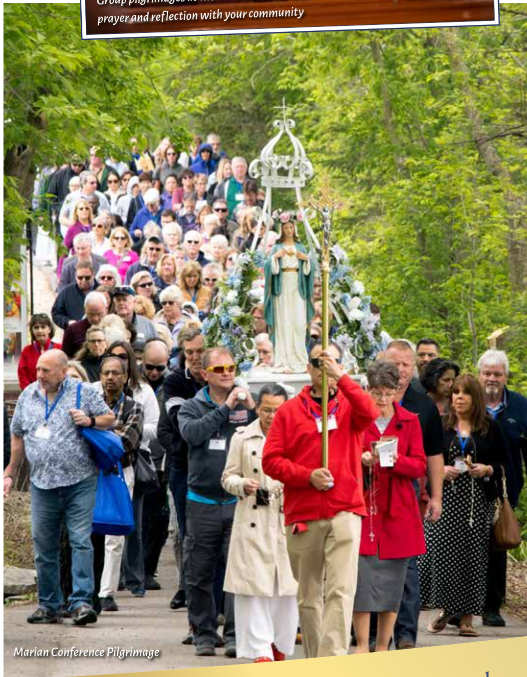
Marian Conference Pilgrimage