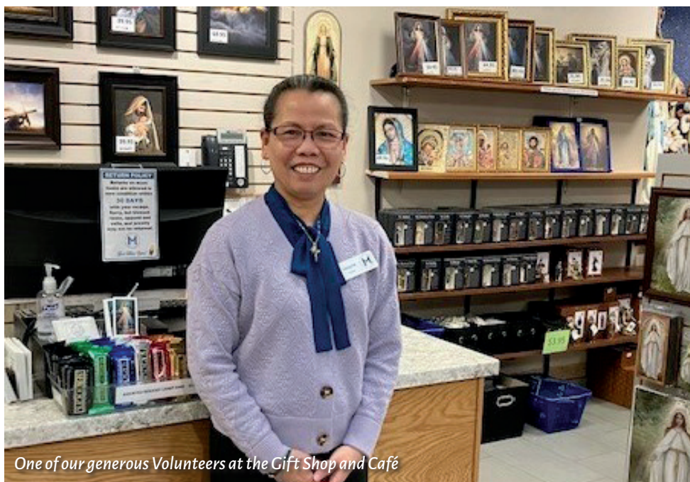
One of our generous Volunteers at the Gift Shop and Café

Or contact our Volunteer Coordinator at 920-866-2571x123 or via email at volunteer@championshrine.org