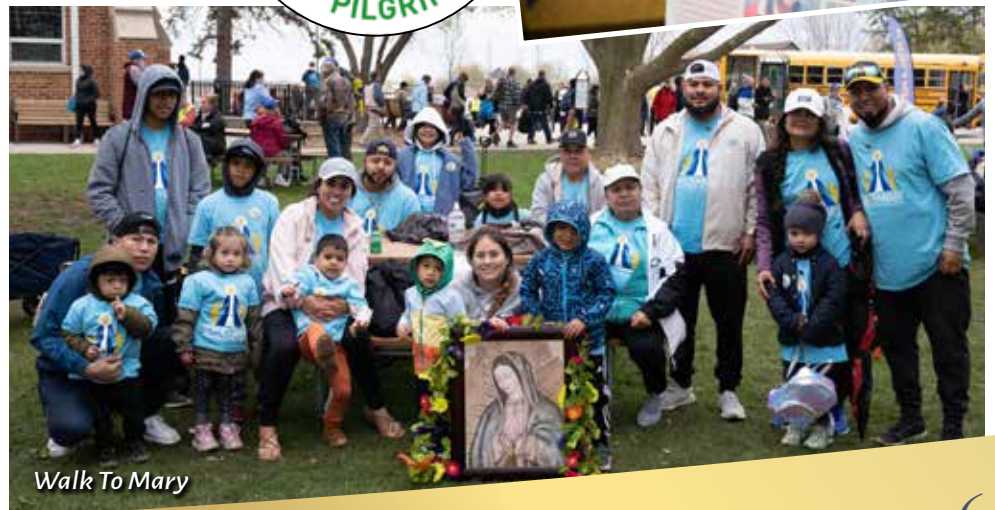
Walk To Mary