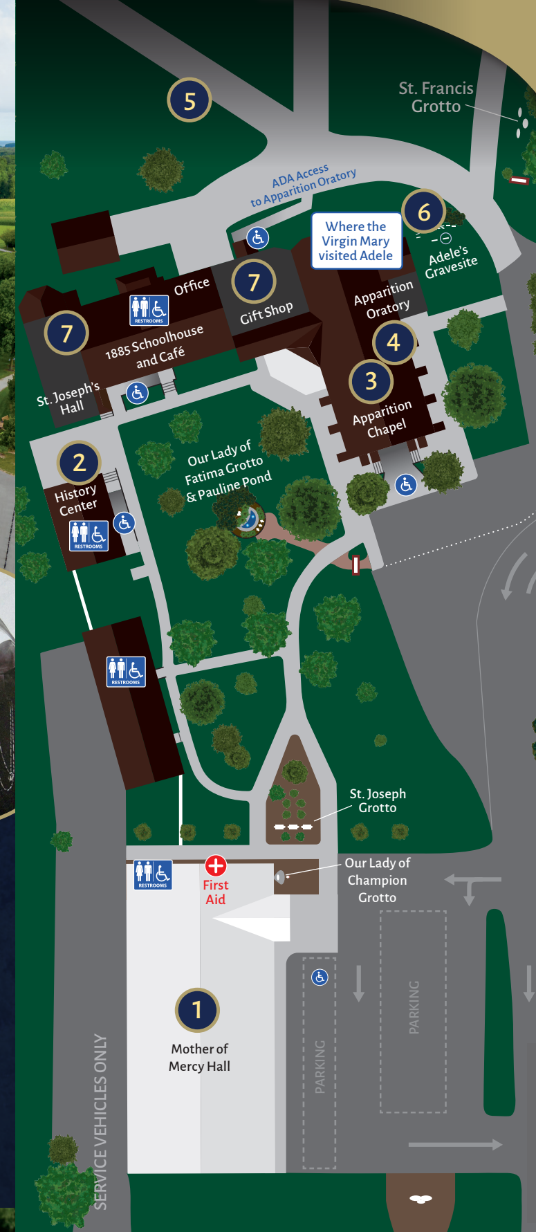
Map of Rosary Walk and Stations of the Cross

See adjacent map of Rosary Walk and Stations